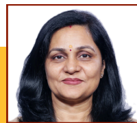
Smt. Sunita Duggal, IRS

Former Member of Parliament Sirsa, Haryana