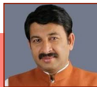
Shri Manoj Tiwari

Former Minister of State for Consumer Affairs, Food and Public Distribution and Environment, Forest and Climate Government of India