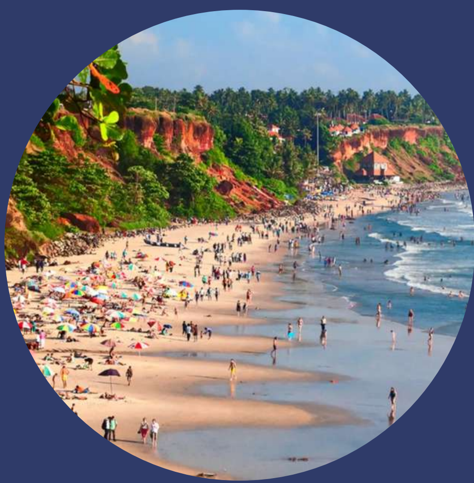
Varkala Beach & Cliff

Thiruvananthapuram is the capital city of Kerala - God's own country. Lakshmi Bai National College of Physical Education, the Conference venue is located at a distance of 14 Kms from the Thiruvananthapuram International Airport (TRV). The nearest Railway Station is Kazhakuttam within a distance of 4 Kms. Major tourist attractions in and near Thiruvananthapuram include: