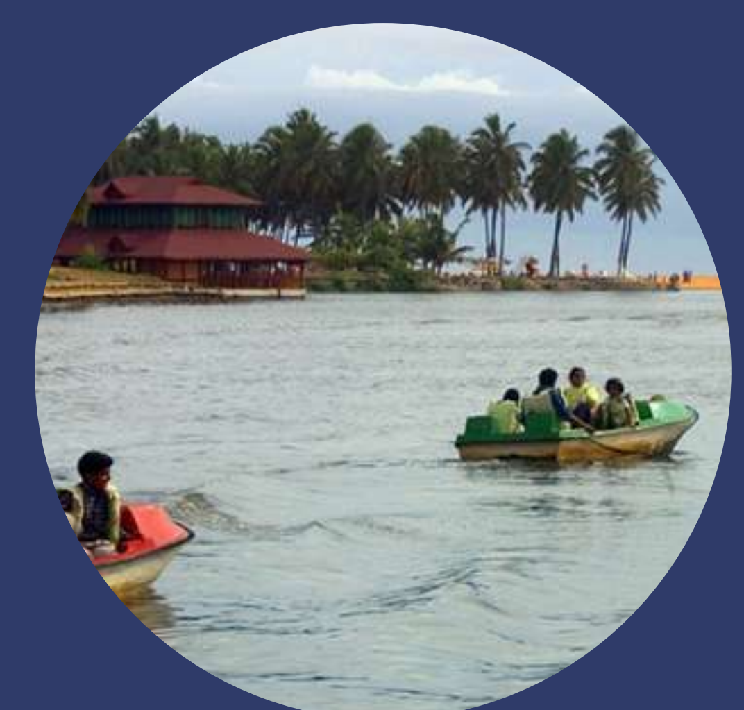
Veli Tourist Village

Note: Sightseeing facility will be provided to the Conference Delegates on one day of the Conference