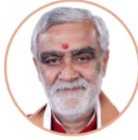
Shri Ashwini Kumar Choubey Minister of State for Consumer Affairs, Food and Public Distribution and Environment, Forest and Climate Government of India