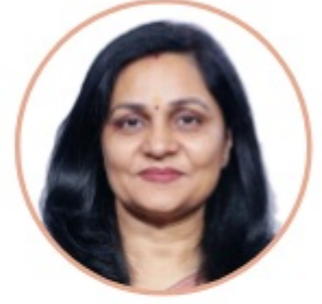
Smt. Sunita Duggal, IRS Member of Parliament Sirsa, Haryana