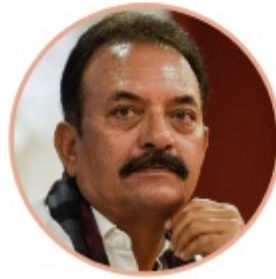
Shri Madan Lal Indian Former Cricketer