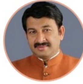
Shri Manoj Tiwari Member of Parliament North East Delhi