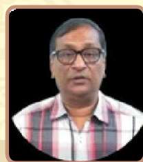
Guest of Honour